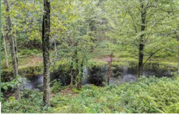
Vernal pool at Kurmes Preserve

In the heart of Kurmes Nature Preserve, Tank Creek and Yankee Run – both high-quality coldwater creeks – join to form Paradise Creek. The Pennsylvania Department of Environmental Protection has designated Paradise Creek an “Exceptional Value” stream, with water clean and cold enough to support wild trout.